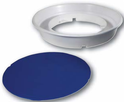
INCLUDES SPLASHPAN & TWO BATS